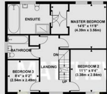
FIRST FLOOR GROSS INTERNAL FLOOR AREA 593 SQ FT