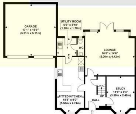
GROUND FLOOR GROSS INTERNAL FLOOR AREA 926 SQ FT

Although every attempt has been made to ensure accuracy, all measurements are approximate and no responsibility is taken for any error, omission, or mid-statement. This floor plan is for illustrative purposes only and not to scale. Measured in accordance to RICS standards.