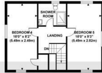
SECOND FLOOR GROSS INTERNAL FLOOR AREA 463 SQ FT